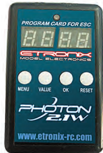
Optional LED programming card

Default settings are shown in the grey boxes